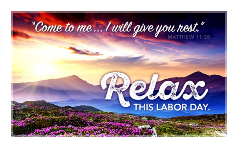
Happy Labor Day!! The Church Office will be closed September 7th