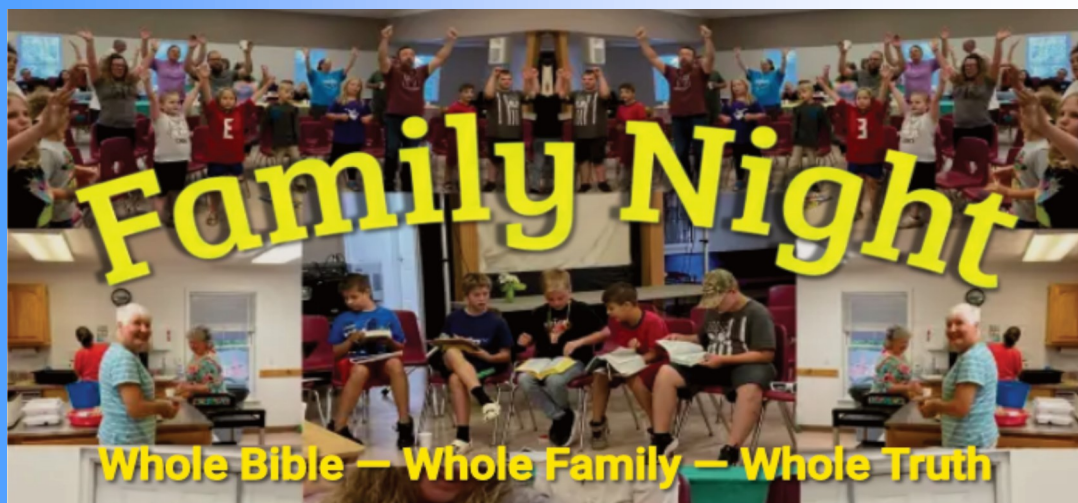
Every Wednesday night at 6pm. Dinner, music, learning. Open to anyone and everyone—see you there!

The Fellowship & Connections Committee is arranging a lunch trip to Mabry Mill Restaurant on a Saturday in the very near future. This will be Dutch treat, and we will announce a scheduled date as soon as reservations are made.